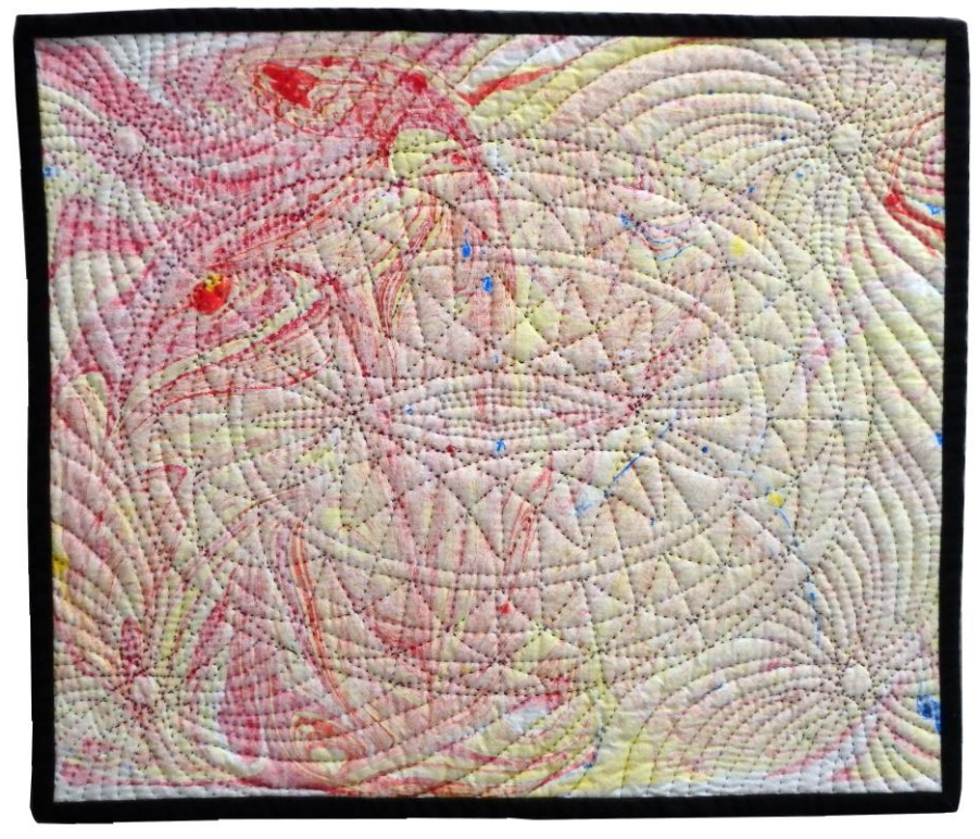
Exhibition and Publication History

Aged Psychedelic #7 (14" x 16"/ 35.5 x 40.5cm) (c) 2017-2021 Jean M. Judd/Artists Rights Society (ARS) New York Hand Stitched Thread on Hand Marbled Textile **Available for Purchase - $2,300**